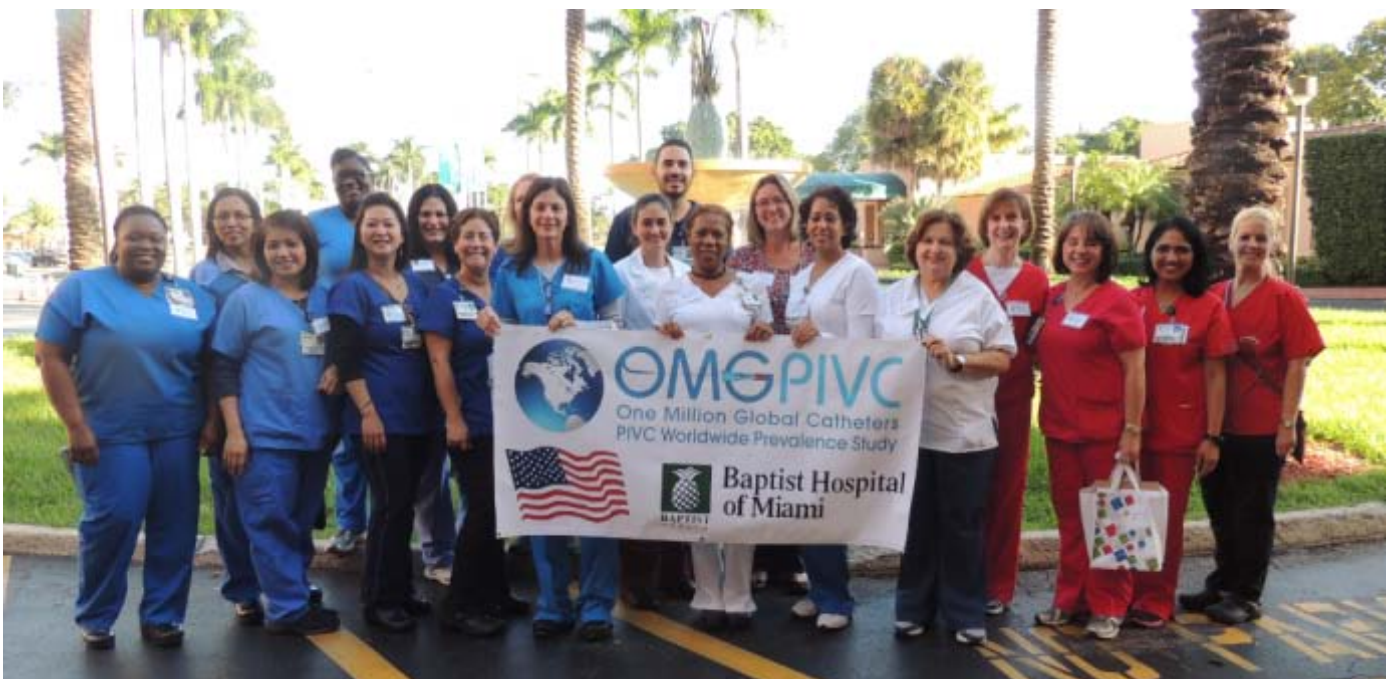
Below: Baptist Hospital of Miami, Florida, USA, gets into the OMG spirit!

The Hawke's Bay DHB's district lies on the east coast of the North Island of New Zealand, and serves a population of 155,000 people.