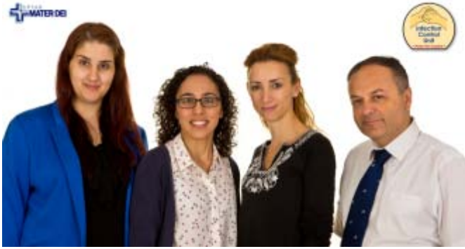
Above: The Infection Control team at Mater Dei Hospital, Malta.