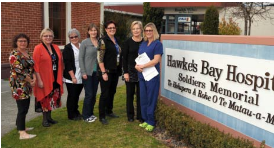
Left: Hawkes Bay, New Zealand