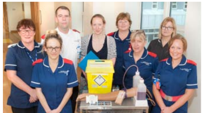
Above: The OMG team at University Hospital Coventry and Warwickshire, Walsgrave, United Kingdom

Thanks to all of you for being a part of the OMG PIVC study!