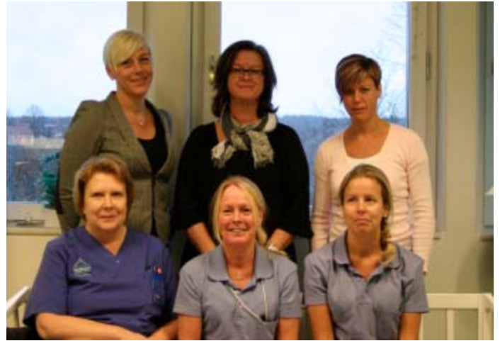
Right: Central Hospital Växjö, Kronoberg, Sweden